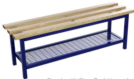
Bench with Shoe Rack Upgrade