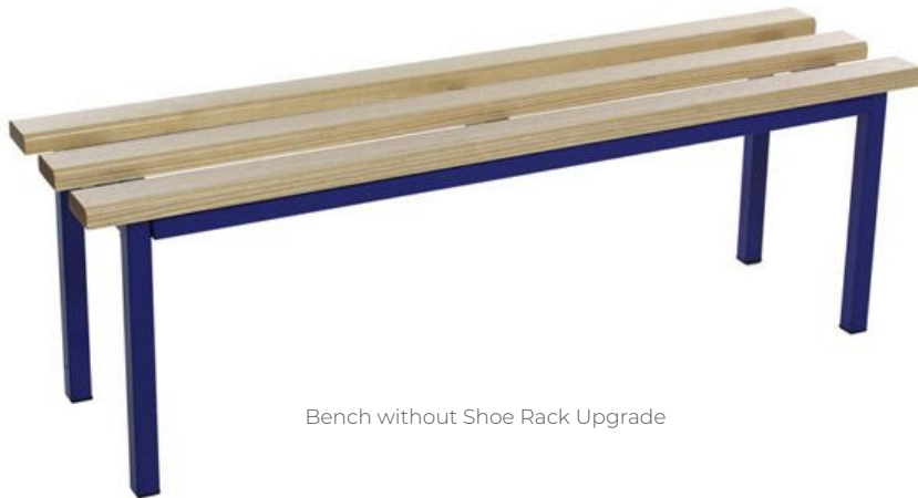
Bench without Shoe Rack Upgrade