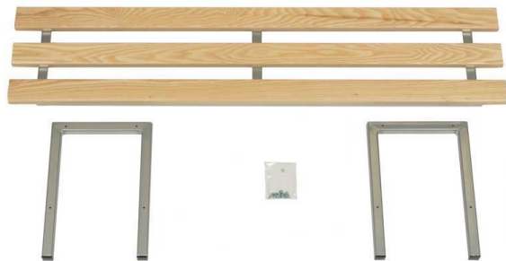
Bench before install